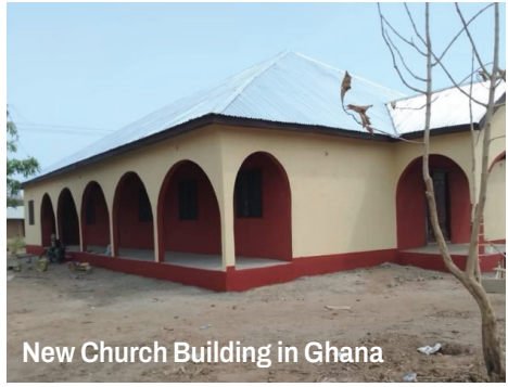
New Church Building in Ghana

In a closed Caribbean country, Pastor Daniel has evangelized with great passion across a large territory in the central region of the island. In four towns, new believers have been discipled and leaders appointed, but they have no place to meet. Some of the donations to IBC's Thanksgiving offering have been sent to this country for church planting. Houses in all four towns are being purchased and remodeled and will soon be used as houses of worship!