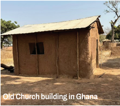
Old Church building in Ghana