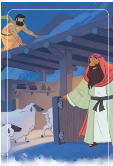
The Good Shepherd John 10

Key Passage: Psalm 40:5(ESV) “You have multiplied Oh Lord, my God, your wondrous deeds and your thoughts toward us; none can compare with you!”