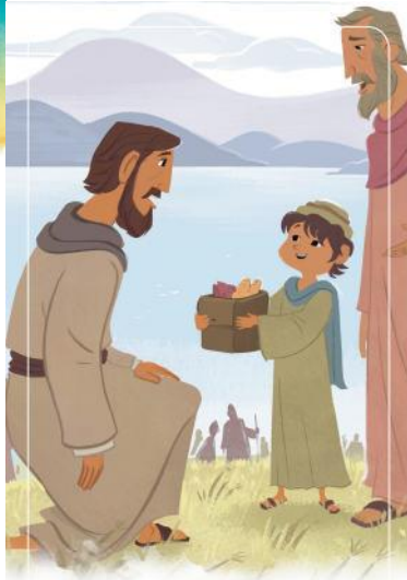
Jesus Fed a Crowd