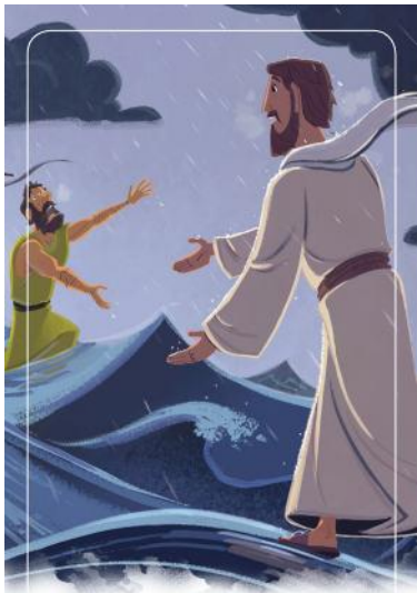
Jesus Walked on Water