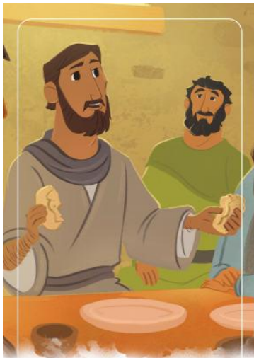
The Last Supper Matthew 26 Mark 14 Luke 22 John 13

Key Passage: Philippians 2:8 Babies & Toddlers Christ Connection: Jesus spoke with wisdom that comes from God. Preschool Christ Connection: When the religious leaders asked Jesus questions, He answered with wisdom. Jesus is the Messiah, the Son of God. He came to show us what God is like. Jesus has power in heaven and on earth. Big Picture Question & Answer: What did Jesus do to save us? Jesus died on the cross and rose from the dead. Story Point for Babies & Toddlers: Jesus died to rescue us. Story Point for Preschoolers: Jesus spoke with wisdom. Gospel Gems: • Some teachers tried to trick Jesus. • Jesus answered with wisdom. • Jesus told the people that He is the Messiah, the Son of God.