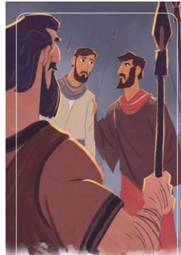
Jesus Was Arrested Matthew 26-27

Key Passage: Philippians 2:8 Babies & Toddlers Christ Connection: Jesus made a new, even better covenant. Preschool Christ Connection: God made a covenant, or agreement, with His people long ago. The people promised to love and obey God, and He promised to be their God. Sadly, God's people broke the covenant. God sent Jesus to make a new, even better covenant. God would forgive people for their sins, and God would help them obey Him. Big Picture Question & Answer: What did Jesus do to save us? Jesus died on the cross and rose from the dead. Story Point for Babies & Toddlers: Jesus died to rescue us. Story Point for Preschoolers: Jesus told His disciples to remember Him. Gospel Gems: • Jesus ate a special meal with His friends. • Jesus told His friends about God's plan. • Jesus told His friends to remember what He did for them.