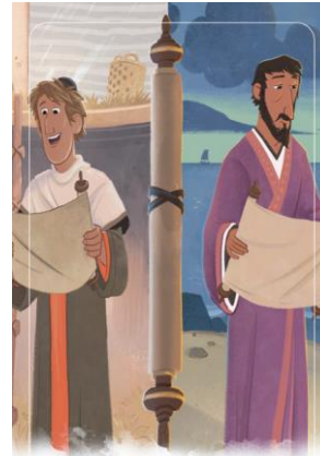
Letters to Church Leaders 1-2 Timothy; Titus