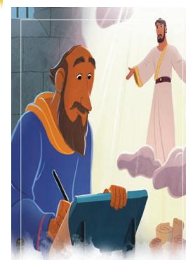
Paul Gave Hope 1-2 Thessalonians