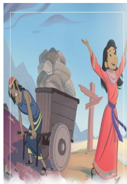
No Other Gospel Galatians 1-3