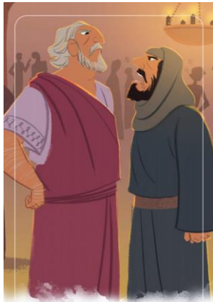
The Church Divided 1 Corinthians 1-6